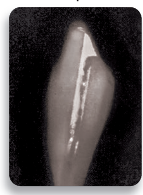
Placing material traditionally with spatulas or spiral paste fillers.