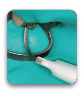
4) Squeeze syringe with a slow, steady pressure and inject into prep.