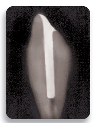
Placing material with C-R® Tubes and Plugs creates voidand porosity-free restorations.