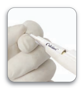
3) Bend needle as needed. Test first on pad.