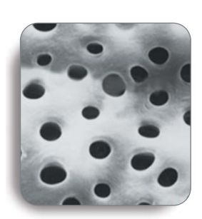
Dentin before treatment with D/Sense Crystal.