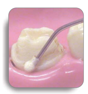
SofNeedle Tip accurately treats dentin without harming soft tissue.